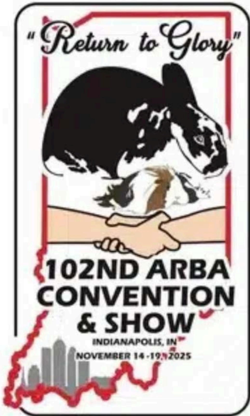
102nd ARBA Convention & Show November 14-19, 2025