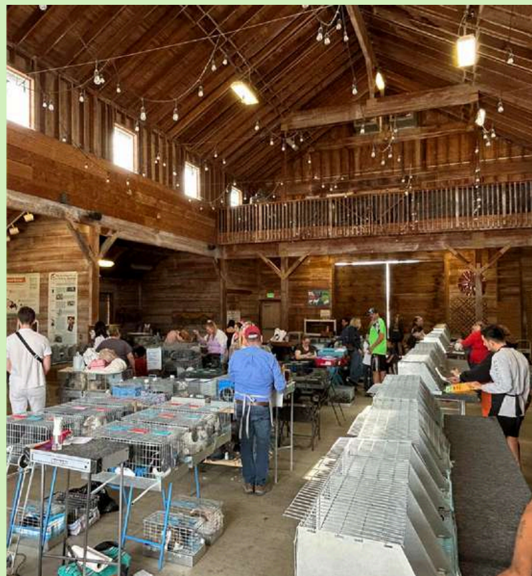
Millennium Barn at Centennial Farm OC Fair & Event Center